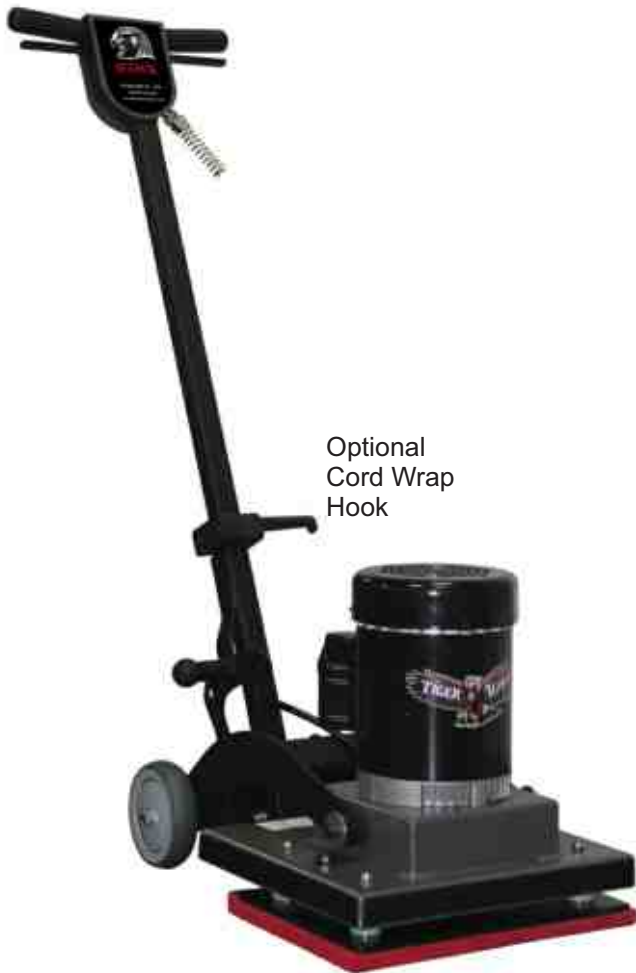
Optional Cord Wrap Hook