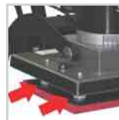
(4) Rubber Vibration Isolators