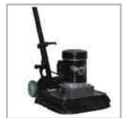
Optional Full Wraparound Dust Skirt #TH1011-1410