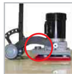
Floating Head Frame with 1.5" Vacuum Port