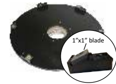
XHD Scraper Blade Driver