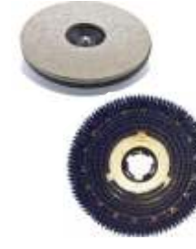
Pad Drivers & Brushes