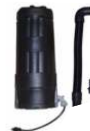
Vacuum Assembly Kit