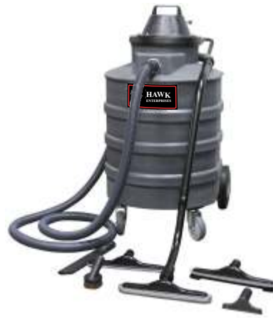
HAWK Titan V29