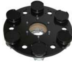
Orbitec Diamond Tool Driver