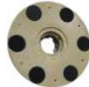
HAWK GRIP Driver