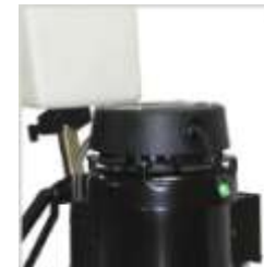
Electric Solution Sprayer