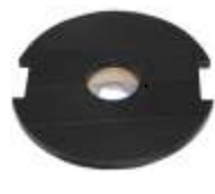
HAWK Weighted Driver