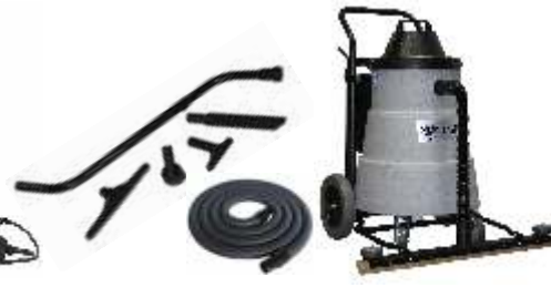
HAWK V20 20 Gal. Wet/Dry Tank Vacuum