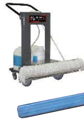
HAWK Flight Speed Water/Solvent Applicator