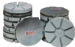
HAWK Polishing Pads