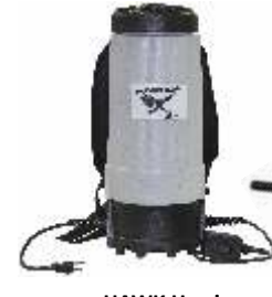
HAWK Harrier 6 Qt. Backpack Vacuum