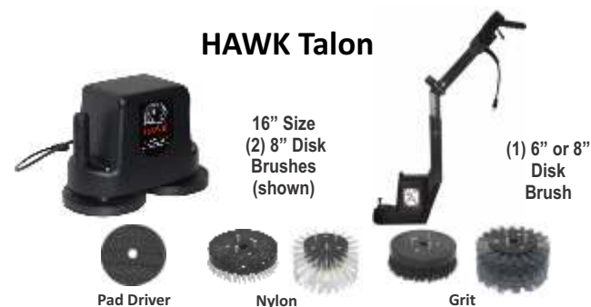
HAWK Twin Talon Dual Motor Polisher - Edger