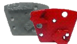
HAWK Preparation Tooling