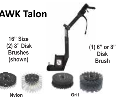
HAWK Talon Tight Area Floor Machine