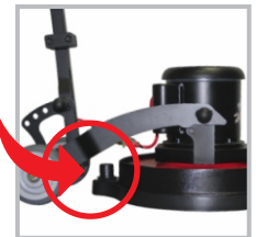
Optional Dust Control Ring Connects to Tank