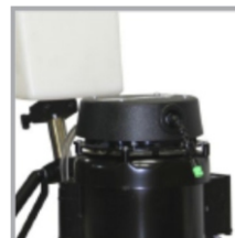
Optional Osprey Sprayer Kit