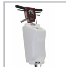
Optional 4 Gallon Solution Tank