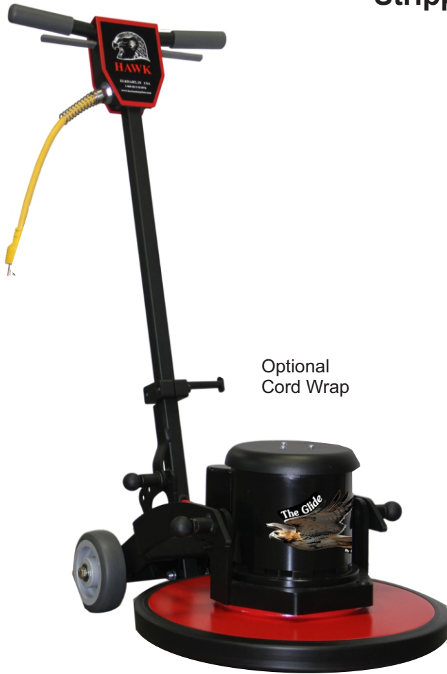
Optional Cord Wrap

The HAWK Glide delivers up to twice the performance of traditional floor machines with greater safety and 1/3 less amp draw. The unique "Floating Head" WD™ Wheels Down handle carriage design provides 100% contact with the floor and steers the Glide in forward and backward movement - unlike the side-to-side movements of swing buffers. Use the Glide XHD model for the toughest jobs with 11:1 industrial gears to power tools and drivers at 165 RPM. Easy to learn. Easy to use.